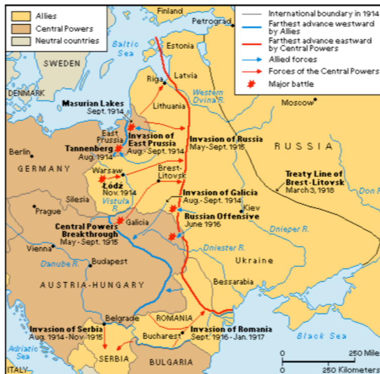
World War I: Eastern Front

The Eastern Front swung back and forth until Russia agreed to stop fighting late in 1917. Under the Treaty of Brest-Litovsk, Russia gave much territory to Germany. To the south, the Central Powers had crushed Serbia in 1915 and Romania in 1916.